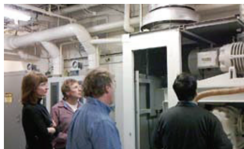
Checking environmental frameworks at TEL FSI, Inc.

In fiscal 2013, the Group was not involved in any environment-related incidents or accidents, nor committed any violations of environmental law, nor was subject to any related legal proceedings.