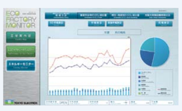
Eco Factory Monitor

Energy used in offices, production processes and assessment facilities can be checked by employees over the intranet using the Eco Factory Monitor. Empowering employees to visibly monitor their use of energy will help us promote energy conservation activities where all employees participate.