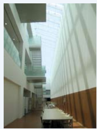
Natural light collection system