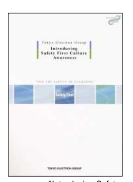
"Introducing Safety First Culture Awareness

We have published and distributed brochures titled "Introducing Safety First Culture Awareness" and "Our Approach to Safety First" and hope that our customers and other stakeholders will understand our approaches and efforts on this issue. (See "Topics.")