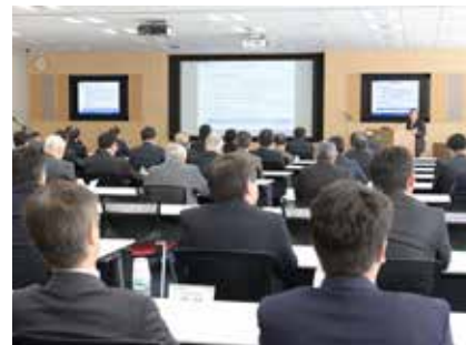
TEL Partners Day held in fiscal year 2015

In June 2015, the TEL Group joined the EICC® to continue to promote EICC®-compliant supply chain CSR.