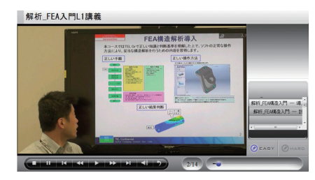
Analysis education using the Internet

In Focus From the manufacturing workplace—Improving quality and productivity through TPM activities 1