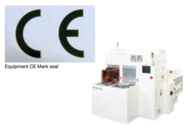
CE Mark approved equipment

In order to secure the safety of the equipment we sell, TEL has adopted the SEMI S2 standard, a semiconductor industry safety standard, for producing our equipment. Furthermore, to demonstrate our level of safety, TEL has third parties perform inspections and certifications for SEMI S2 standards. For exports to European regions, we declare that we are in compliance with the CE Marking European safety standards outlined in EU directives and apply a CE Mark on our products prior to shipping. This compliance declaration can only be executed when it is reviewed and approved by the CE Marking review team, our in-house auditing body.