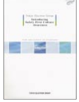
The "Introducing Safety First Culture Awareness"