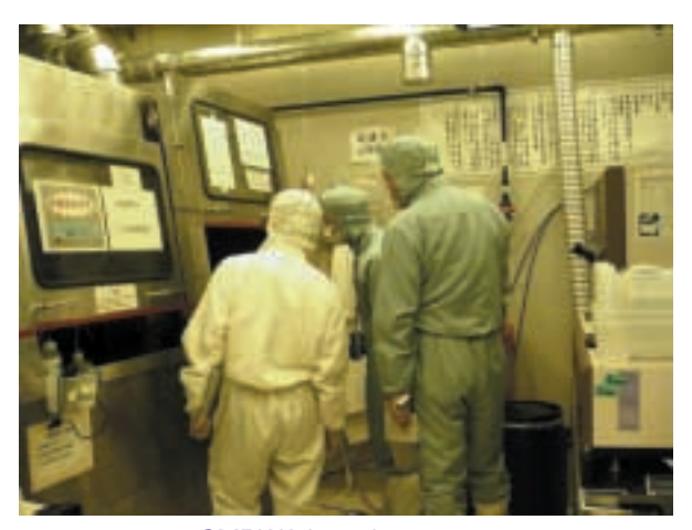
SMBWA in a clean room

As a result of these activities, we aim to reduce our 2001 Accident Reduction Target to 50% of the actual figures for 2000.