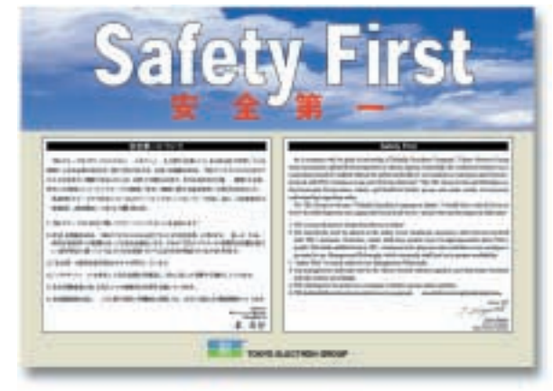
"Safety First" poster

The TEL Group has also incorporated its environmental, health, and safety principles into its Management Philosophy. We are convinced that giving the highest priority to health, safety, and the environment will help establish consumer trust in the TEL Group and will eventually lead to greater profitability.