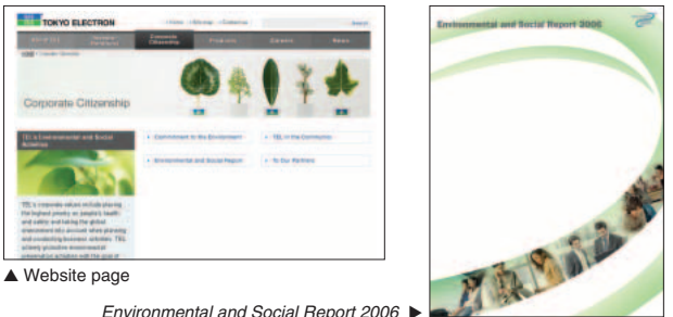
Environmental and Social Report 2006

We have published our annual environmental report since 2000 and disclose environmental, health, and safety information on our website. We will continue to disclose information and promote communication with our stakeholders in many different ways.