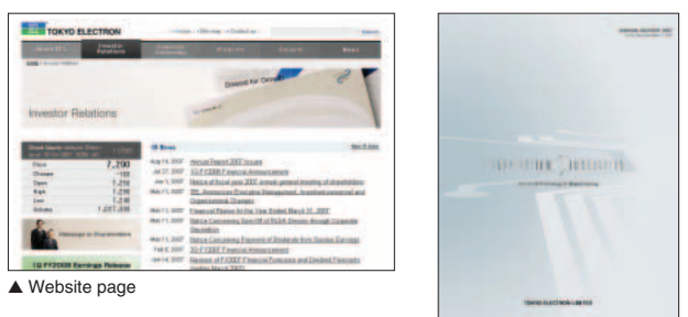
Annual Report 2007

We use the intranet for speedy disclosure and sharing of EHS information within the Group. The Group's EHS activities are also introduced via brochures for shareholders and investors and the annual reports.