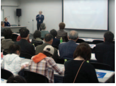
Participants on a study tour

ment to local elementary, junior high, and senior high schools. These sites also offer learning experiences and the opportunity to visit their plants to local schoolchildren, and provide financial and other support to local events such as festivals and to blood donation activities.