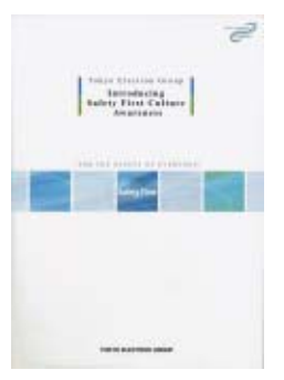
The "Introducing Safety First Culture Awareness"