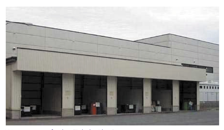
Waste storage facility (Tohoku Plant)

Sorting is essential for recycling to work. At every plant, we collect wastes sorted by their physical properties into 26–46 different classifications.