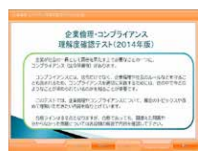
Web-based, test-format education

We also provided web-based, test-format education on business ethics and compliance to all Group executives and employees in fiscal year 2015, including those overseas, as we did in the previous year. These efforts will be continued every year.