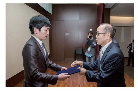
Semiconductor scholarship award ceremony

TEH also sponsors such non-profit organizations as the Meals on Wheels program (which delivers meals to disabled elderly people), the Juvenile Diabetes Research Foundation (which researches diabetes in children), The Nature Conservancy (a world-renown nature conservation group), and the international NGO Habitat for Humanity (which supports the construction of housing) through scholarships and volunteer initiatives. In addition, TEH is also an advocate for STEM* education programs in Texas, where their offices are located.