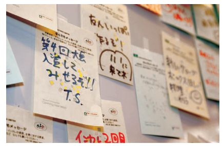
Enthusiasm of students who took part in the Science Intercollegiate

My three children took part in the "Let's talk with outer space!" event aimed at elementary, junior, and senior high school students. I watched the children listening with rapt attention, and the phrase "sense of wonder" came to my mind. Compared to adults, children are much more curious and sensitive to the unknown and mysteries. The event was a great way for them to learn about science while having fun. Though the contribution to society is not immediately obvious, I believe that offering a great opportunity like this as a business sponsor is very meaningful.