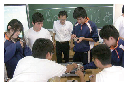
Lesson at a visiting lecture

Certificate of appreciation for Tohoku recovery assistance