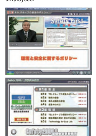
Basic safety update training via the Internet

In fiscal 2010, our triennial basic safety training took place. This program dealt with various themes, including messages from top management about the Group's environment and safety policies, and was attended by all employees.