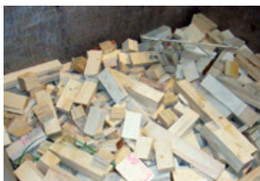
Recycling lumber from packaging frames

In April 2006, Japan's Act Concerning the Rational Use of Energy (Energy Saving Act) was revised and regulations on logistics were strengthened with the aim of reducing global warming. Accordingly, there are now increasing demands to reduce the environmental impact of logistics. In response, the Tokyo Electron Group has been actively reducing the environmental impact caused by the logistics of its products. For example, we introduced low emission trucks to transport our products and started to recycle unused lumber from packaging frames. We also give top priority to driving safety in delivering products to customers.