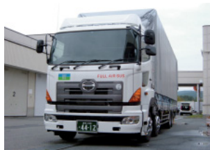
Introducing a low-emission truck

In response, the Tokyo Electron Group has been actively reducing the environmental impact caused by the transportation of its products. For example, we introduced low-emission trucks to transport our products and started to use returnable containers for their delivery. Also, we give first priority to driving safely in delivering products to customers.