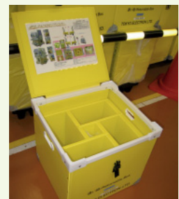
Container for reused casters