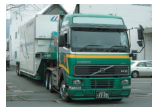
Special truck for transporting FPD production equipment