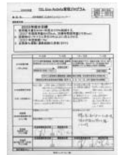
TEL Eco-Activity Management Program

Within TEL, we have created our own TEL Eco-Activity environmental management system based on ISO14001. We have been promoting TEL Eco-Activity in office facilities since last year. Our Fuchu Technology Center established targets of reducing electricity usage by 5% compared to the previous year, improving recycling, and cleaning along the roads our employees use for commuting. Regarding energy conservation, we implemented changes in temperature settings of air conditioners and turning lights off policy during lunch breaks. In the future we will continue with energy and resource conservation activities, and encourage everyone to work to meet the targets. In addition, we have gone further with TEL Eco-Activity at the Tokyo Electron Device headquarters and plan to obtain ISO14001 certification by October 2004.