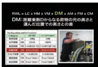
Video on preventing ergonomics-related accidents

In order to prevent the reoccurrence of accidents that have actually occurred during work on high structures or near large openings in the floor, and involving heavy lifting gear or electricity, we have created videos that reproduce actual accidents using 3D images. This visual presentation helps us to check the management system at the time of the accident, the work load status of the injured, and whether or not adequate communication has taken place. These videos are becoming an integral part of our safety training.