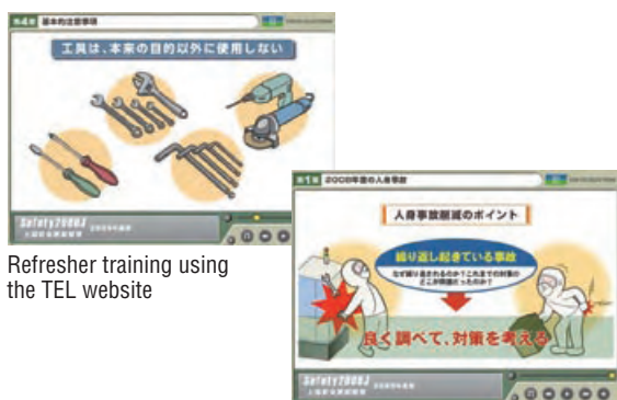
Refresher training using the TEL website

In fiscal 2010, refresher safety training comprised a variety of themes including controlling dangerous energy (importance of carrying out lockout-tagout 2 ), effective use of protective gear for the head, hands and feet, safe handling of cutters and other hand tools, as well as risks posed by automatic guided vehicles used at our customers' sites. These safety refresher courses are conducted online; this allows our employees to take the course at their convenience and allows their progress to be monitored.