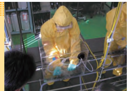
Safety sensitivity training

Tokyo Electron FE Ltd. is providing safety awareness training at major Field Engineer (FE) service bases. These practical training sessions were first held at its Fuchu Office in April 2010, and since May have been expanded to other field service bases in Japan. These activities aim to drive home to engineers the importance of workplace safety and prevent occupational accidents by providing them with simulated experiences of workplace dangers. Permanent training facilities/equipment for this safety program have been installed at the Fuchu office, which has started to carry out activities systematically, including developing simplified moveable training tools for use in training at FE bases as well as dispatching trainers. The training program covers broad areas ranging from the wearing of safety belts during work on high structures, awareness of physical loads suspended in the air, to awareness of the risk of electrocution.