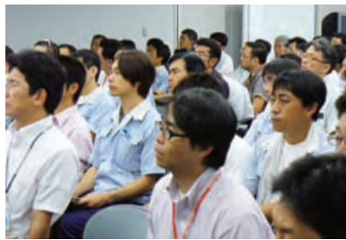
Lecture on the basics of equipment safety design