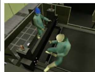
Video reproducing accidents using 3D images