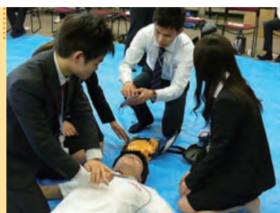
New employees undergoing CPR/AED training

Cardiopulmonary resuscitation (CPR) and automated external defibrillation (AED) are both effective methods of saving lives in the case of cardiac arrest, including certain cases of sudden heart attacks, water accidents or electrocution. The TEL Group invites external specialists to provide employees with periodical CPR and AED training. Feedback from participating employees includes, "Many more people can be saved if more people are able to use CPR and AED in an emergency" and, "It will help if a family member meets with an accident."