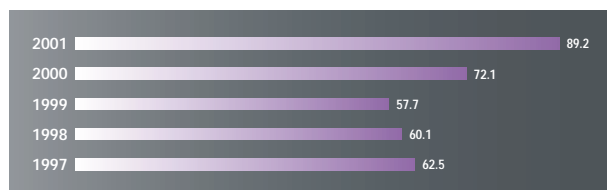
ELECTRONIC COMPONENTS SALES (¥ Billions)

Net sales for the Electronic Components (EC) division increased 23.8 percent to ¥89.2 billion, a record for the second consecutive year. The division focused on products for high-growth sectors including mobile communications, Internet appliances, infrastructure equipment required for next-generation mobile phones, and digital consumer appliances such as DVD and car