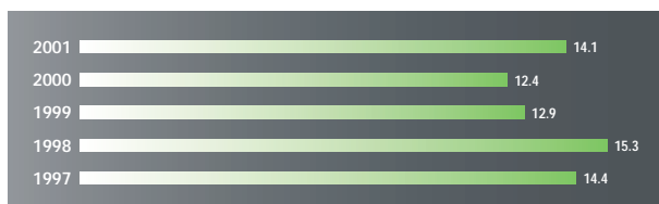
COMPUTER NETWORK SALES (¥ Billions)

Progress in broadband network creation has added urgency to the need to increase data storage capacity and growth in internet Data Center (iDC) business. As a result, sales of Brocade Communications Systems' Fibre Channel switches, which are key to constructing SANs, increased 5.3 times year-on-year. Moreover, increasing data volume has heightened the need for