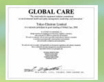
A declaration expressing our endorsement of Global Care™. It has been submitted to SEMI.

For further information on our environment, health and safety activities, please see our Environment Report. (available at http://www.tel.co.jp/index_e.html)