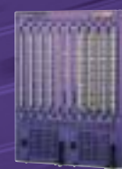
Extreme Networks, Inc. Gigabit Ethernet Switch