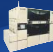
Coater/Developer CLEAN TRACK ACT®12