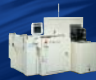
Fully Automatic Wafer Prober P-12XL