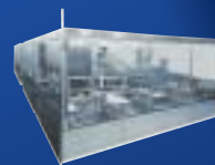
FPD Coater/Developer CS800