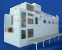
Cleaning System UW300Z