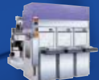
Plasma Etch System Telius™