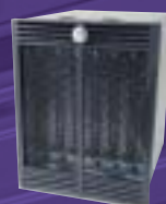
Brocade Communications Systems, Inc. Fibre Channel Integrated Fabric Switch