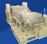
FPD Plasma Etch/Ash System SE1200