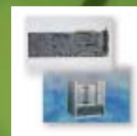
Board computer products