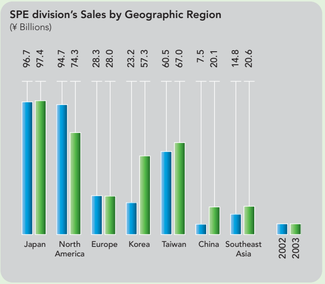
Sales by third-party products imported into Japan are included in Japan Sales