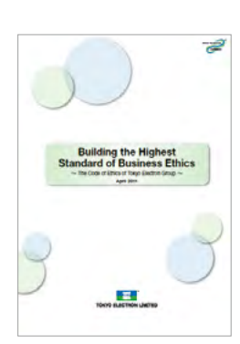
Code of Ethics of the Tokyo Electron Group

Trust from stakeholders is the cornerstone of business activities. In order to maintain trust, it is necessary to continuously act in rigorous conformity to business ethics and compliance. In line with the Fundamental Policies Concerning Internal Controls within the Tokyo Electron Group, all Group executives and employees are required to maintain high standards of ethics and to act with a clear awareness of compliance.