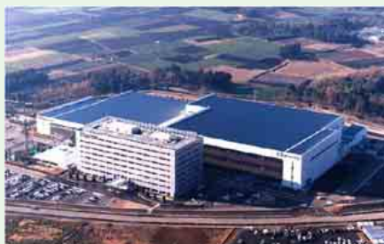
Tokyo Electron Kyushu Limited, Koshi Plant

Tokyo Electron Kyushu Limited's Koshi Plant in February 2005 won the Kyushu Bureau of Economy, Trade and Industry Director's Prize (Electrical Division), which is awarded to manufacturing plants in recognition of notable achievements in energy conservation.