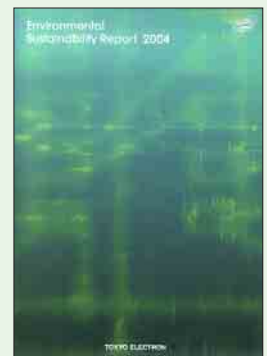
Environmental Sustainability Report 2004

Tokyo Electron has been publishing environmental reports since 2000. We believe that it is important to strengthen communication with the public by providing and sharing as much information as possible about our environmental activities. The environmental report for the fiscal year ended March 2005 is to be published in autumn 2005.