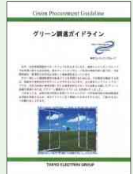
Green Procurement Guideline

Almost all of our materials and parts for the manufacturing of semiconductor production equipment are sourced from suppliers. If we are to reduce environmental loads across all of our business activities, components and raw materials must be produced in ways that take the environment into account. In this respect, we are making an effort to conduct procurement based on our Green Procurement Guideline, buying only from those suppliers who are actively making efforts to reduce environmental impacts. In the future, we intend to start procuring materials only from suppliers who meet specific environmental standards.