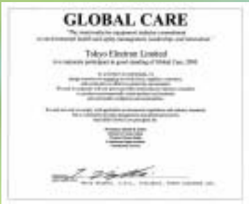
A declaration expressing our endorsement of Global Care™. It has been submitted to SEMI.

No company can achieve this goal single-handedly, and the semiconductor and FPD industries as a whole—from top to bottom of the supply chain—must cooperate in attaining this goal. As an industry leader, Tokyo Electron is involved in a wide range of activities focused on this goal under the Global Care™ Program of Semiconductor Equipment and Materials International (SEMI).