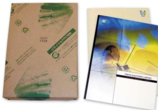
Copy paper (70% reused paper, 70% whiteness) and publication printed on recycled paper.