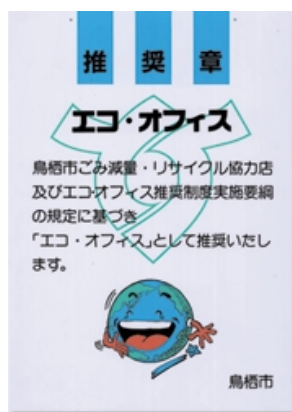
Eco Office commendation

In February 1998, the Saga Plant was awarded a certification by Tosu City under a program called the Tosu City Trash Reduction/Recycling Business and Eco Office Commendation Program. The certification was in recognition of the plant's previous efforts to address environmental issues. The plant will henceforth be inspected and recertified at two-year intervals.