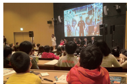
Live feed communication with astronaut Koichi Wakata

The TEL Group participated as a business sponsor for “Let’s talk with outer space!—Connecting outer space and the sea” (organized by Mainichi Shimbun), an event where live transmissions are sent between Astronaut Koichi Wakata who was commander of the International Space Station (ISS), and the Shinkai 6500-manned research submersible currently conducting drills in the Pacific Ocean. Along with an Outer Space Lecture held before the live feed about the origin of space and the Hayabusa asteroid explorer, around 130 children attending the event at Roppongi Hills in Tokyo listened attentively to stories about outer space and the deep sea that they would normally be unable to hear, broadcast in real time from outer space and the depths of the ocean.