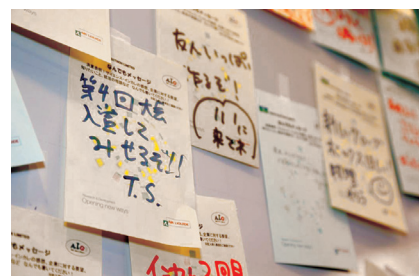
Enthusiasm of students who took part in the Science Intercollegiate

The TEL Group is a special sponsor of the Science Intercollegiate (sponsored by the Ministry of Education, Culture, Sports, Science and Technology), an event where students studying the field of natural science announce the results of their research and compete with one another. It represents the advance of Japan’s science and technology and provides skills necessary for sustainable development, fostering the learning of next-generation engineers. The TEL Group endorses this event as a place necessary for students to enjoy friendly rivalry as well as for promoting incentives for future research activities, and we support the students’ independent research activities.