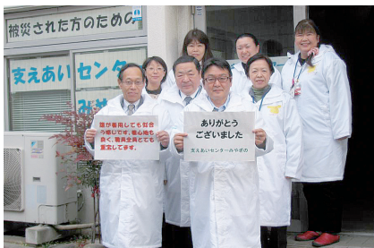
Photo message in response to the bench coat donations