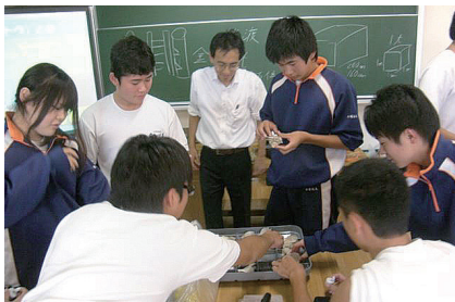
Lesson at a visiting lecture