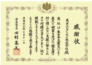
Certificate of appreciation for Tohoku recovery assistance

We hope to help contribute to the recovery of disaster-stricken communities by bringing joy to the local children and residents. Our efforts were recognized and TEL was awarded a certificate of appreciation by the Minister of Health, Labour and Welfare in 2014.