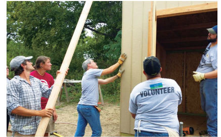
Habitat for Humanity activities

TEH also sponsors such non-profit organizations as the Meals on Wheels program (which delivers meals to disabled elderly people), the Juvenile Diabetes Research Foundation (which researches diabetes in children), The Nature Conservancy (a world-renown nature conservation group), and the international NGO Habitat for Humanity (which supports the construction of housing) through scholarships and volunteer initiatives. In addition, TEH is also an advocate for STEM* education programs in Texas, where their offices are located.