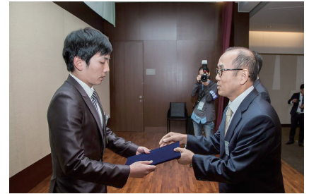
Semiconductor scholarship award ceremony

In addition, with the goal of contributing to the expansion of China’s industry, Tokyo Electron (Shanghai) Limited established the Tokyo Electron Scholarship at Peking University for students in the Microelectronics department.