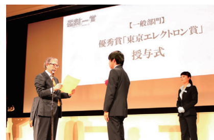
Awarding the Shinichi Hoshi Award

In 2013, Nikkei’s Shinichi Hoshi Award was established as a literary award for exploring scientific ideas. Excellent works with original ideas that look to the future and that have fresh outlooks that inspire are awarded. The TEL Group was awarded the Tokyo Electron Award. In addition, a line tracer robot workshop was held as a related event for elementary and junior high school students at the Setagaya Literary Museum in Tokyo, with TEL Group employees acting as instructors.