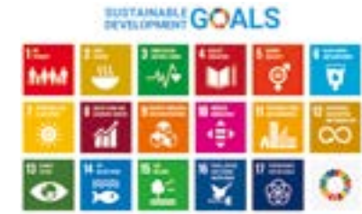
Tokyo Electron Supports the SDGs

Additionally, starting in fiscal year 2021, we have been on a regular basis holding SDGs workshops where employees working in a variety of fields come together and discuss various suggestions for contributing to the achievement of SDGs through business.