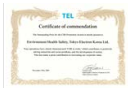
CSR Promotion Award Certificate

In addition to these groups, once a year we invite all employees to submit examples of CSR in the workplace, toward issue resolution and advancement of industry and society, and practice of our Corporate Philosophy. Outstanding initiatives are awarded the CSR Promotion Award by the Representative Director, President & CEO.