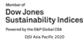
DJSI Asia Pacific 2020

Our CSR activities have received high appraisals from evaluation organizations around the world. We have continued to be selected as a constituent stock under leading global ESG investment indices, including the DJSI 4 Asia Pacific Index, FTSE4Good Index 5 and MSCI World ESG Leaders Indexes 6 , and in 2021, we were also rated as a low-risk company in Sustainalytics' ESG Risk Ratings 7 .