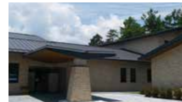
Off-site meetings are held at outside facilities.

Management issues identified through the process of evaluating effectiveness are discussed at Board of Directors meetings by Corporate Directors and Audit & Supervisory Board members with a diversity of opinions and experience. Aside from Board of Directors meetings, separate off-site meetings are also held as an opportunity for focused discussion away from individual matters for resolution.