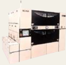
Coater/developer system CLEAN TRACK ACT®12