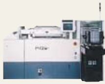
Fully automatic wafer prober P-12XL