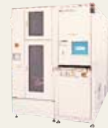
Wafer-level burn-in & test system WX-8