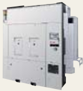
Metal CVD system UNITY®-EP