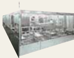
LCD Coater/developer system CS800