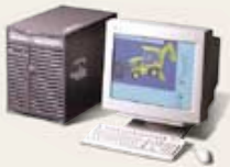
Hewlett-Packard Co. HP Visualize Workstation