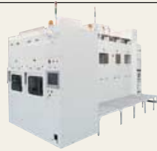
Carrierless cleaning system UW200Z