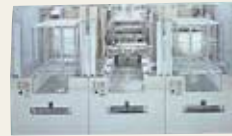
LCD Plasma etch/ash system HT-800