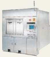
Etch system UNITY®Ver. IIe