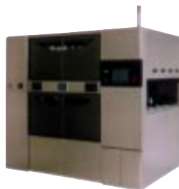
Coater/developer system CLEAN TRACK ACT™8