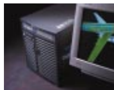
Hewlett-Packard Japan Ltd. HP Visualize Workstation