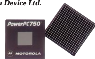
Motorola, Inc. PowerPC750™

PowerPC is a trademark of International Business Machines Corp. (IBM) and is used by Motorola, Inc. under license from IBM.