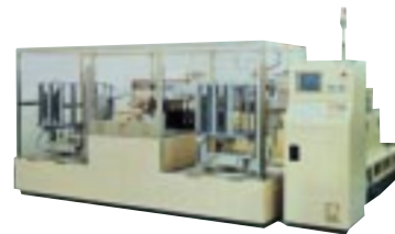
LCD Plasma etch/ash system ME-700

Percentage of consolidated net sales by sector for the year ended March 31, 1999